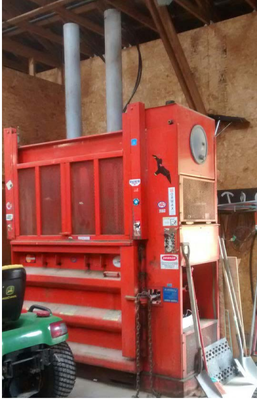
Item #1 Orwak Vertical Double Ram Baler