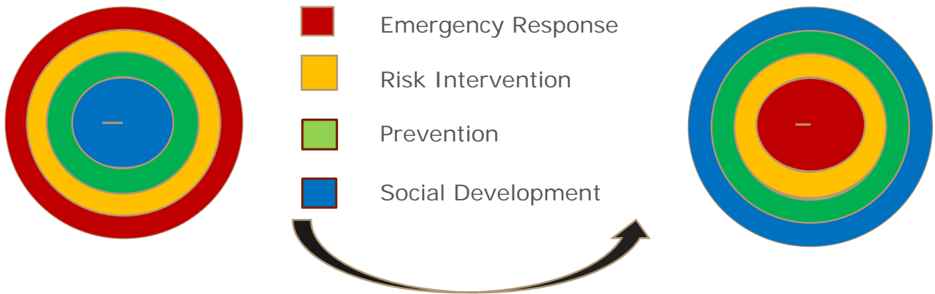
Social Development Chart and Well Being Matrix

The Plan had been in the process prior to legislative changes as Almaguin communities and agencies realized early that change in service delivery and working in a more unified manner would assist all residents.