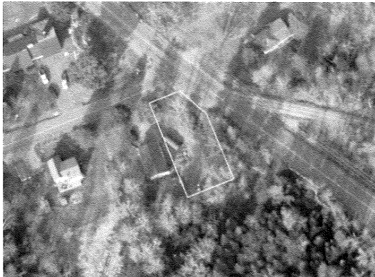
Photo Date: 2023 NOT A PLAN OF SURVEY Boundary may not tie up with actual photo.